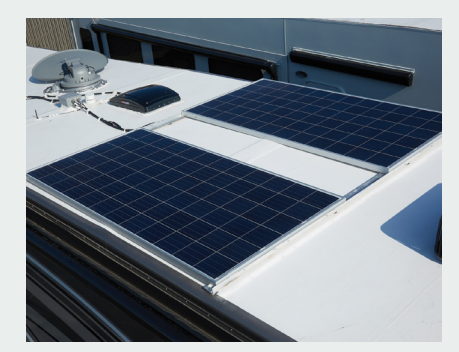
Solar panels provide economical and environmentally friendly additional power.