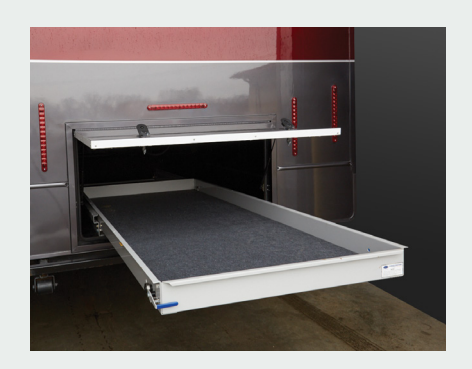
Pull-out cargo trays are available in most Summit and Majestic floor plans.