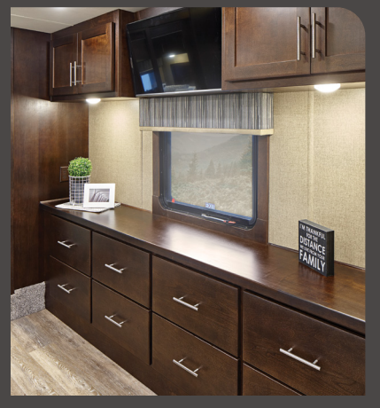
Form and function coexist beautifully. Convenient storage abounds with cabinets and deep drawers everywhere. Beds lift to reveal even more storage. You'll be amazed at all the space-saving innovations, and all the little luxuries that make your life in a Majestic more convenient and comfortable.