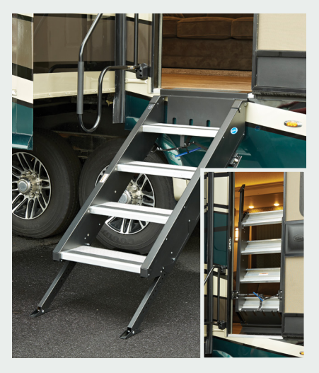
Sturdy and lightweight entry steps stay clean and free of travel damage because they are housed inside the unit during transport.