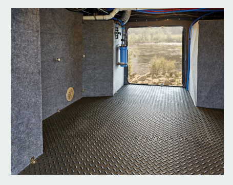
Easy-access basement provides an average of 160 cubic feet of storage.