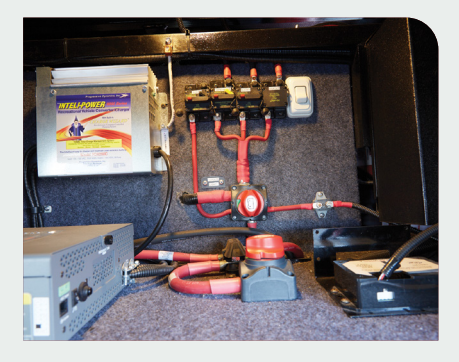
We give great attention to detail in our safety-minded approach to electrical wiring.