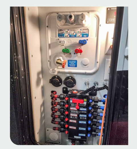
Utility center's residential manifold water system includes shut-offs for each fixture, black and gray tank flush-outs and dump valves.