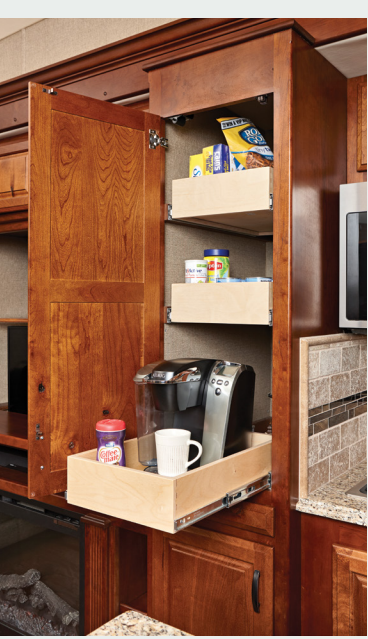
Our pantry features pull-out shelves and an electrical outlet inside making it a great place to stow kitchen appliances.